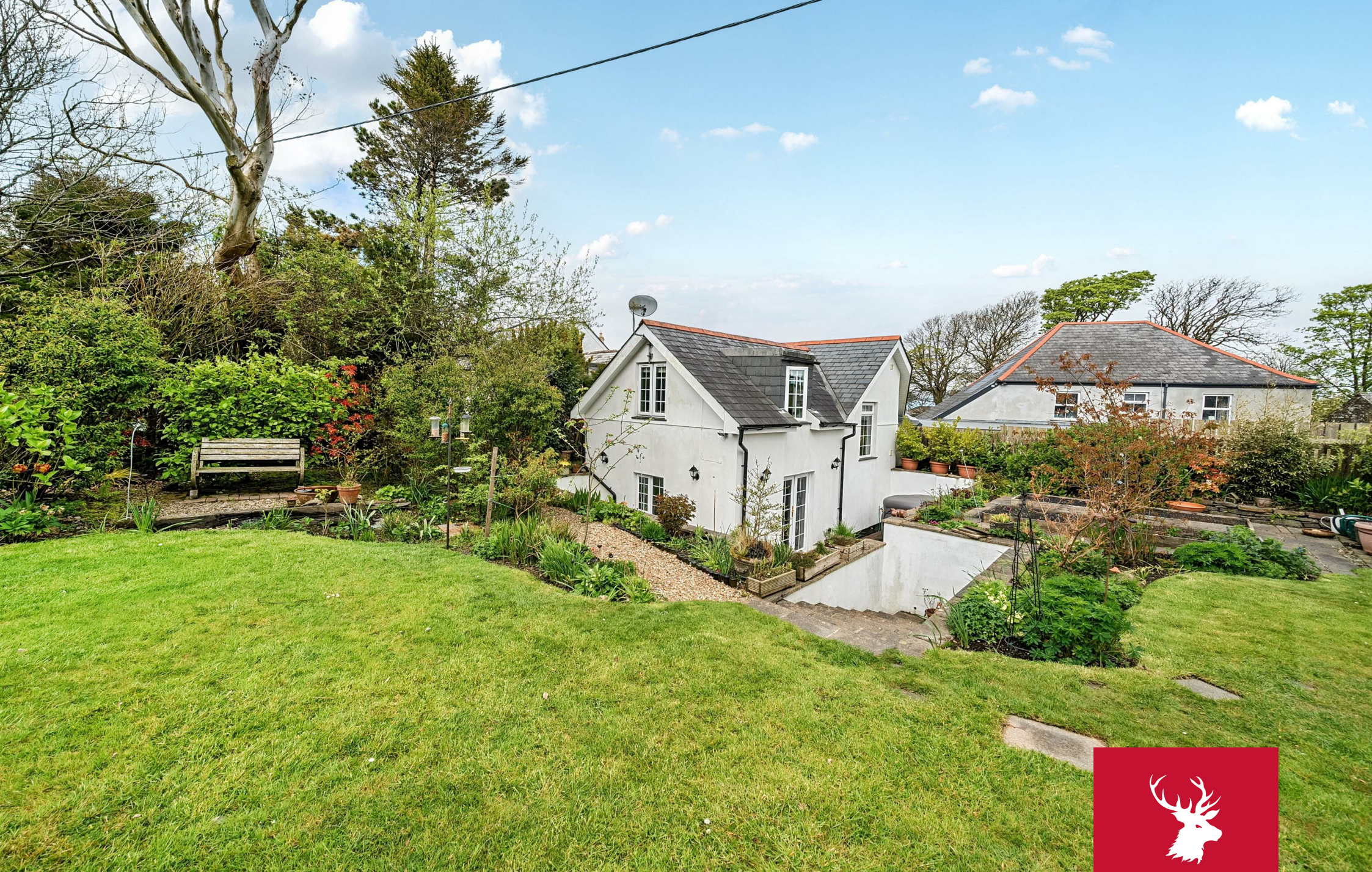
The Old Post Office Cottage